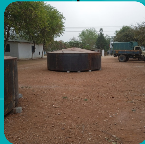
60 Cubic Meter Iron Dome Biogas Plant