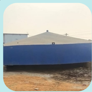
Iron Dome Biogas Plant

Domestic, For Colleges, Universities, Industrial. 2 Cubic Meter to Any Size