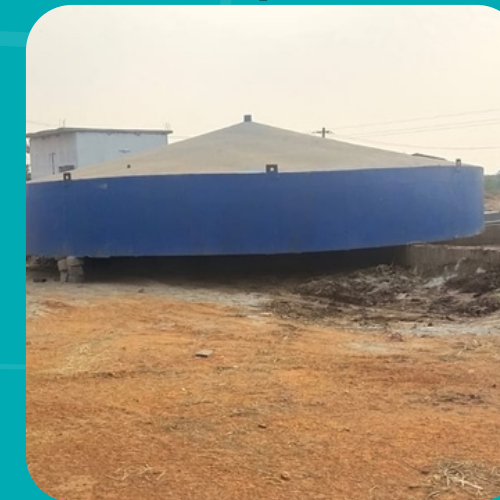
250 Cubic Meter Iron Dome Biogas Plant