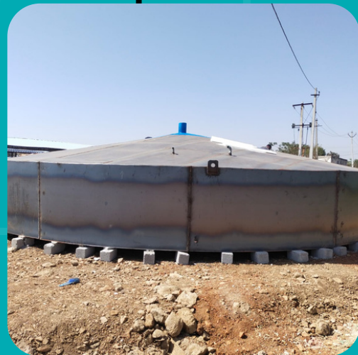
35 Cubic Meter Iron Dome Biogas Plant