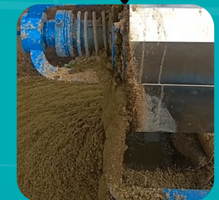
Liquid Solid Separator